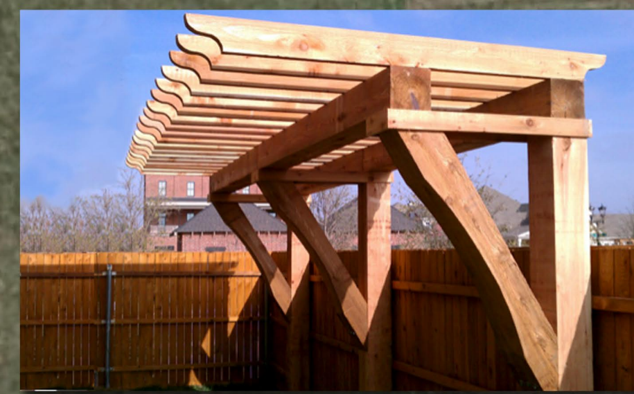
Proposed Wood Pergola