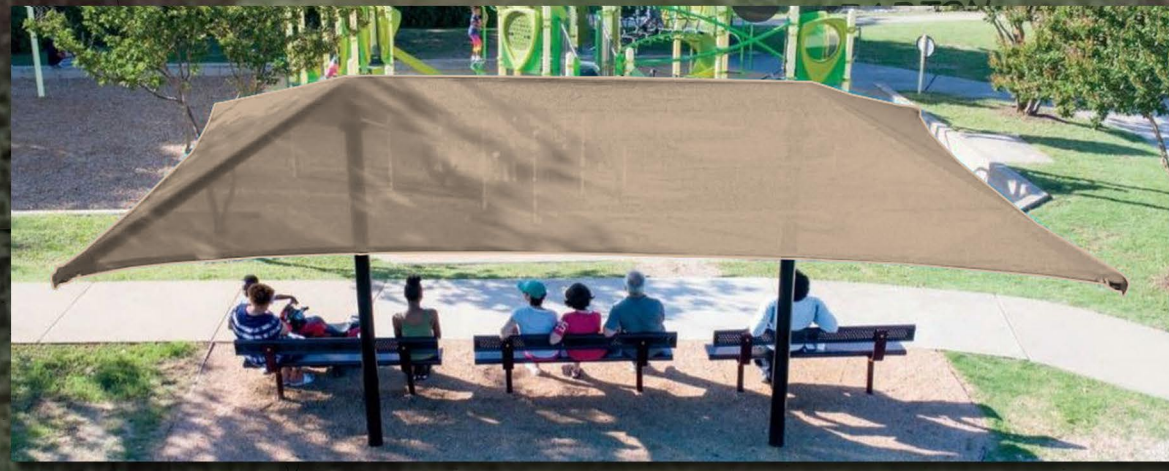
Proposed Shade Structure